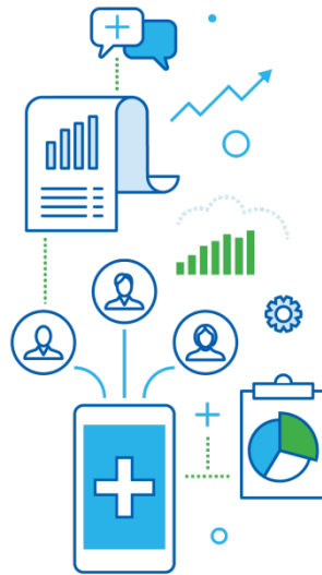
Rich data and analytics