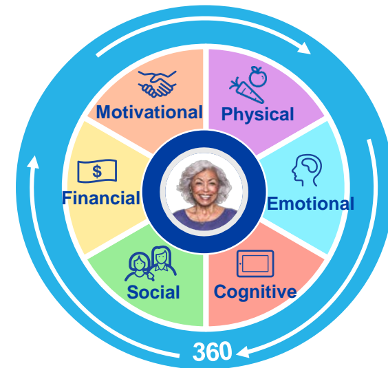
Integration of equity into care management programs